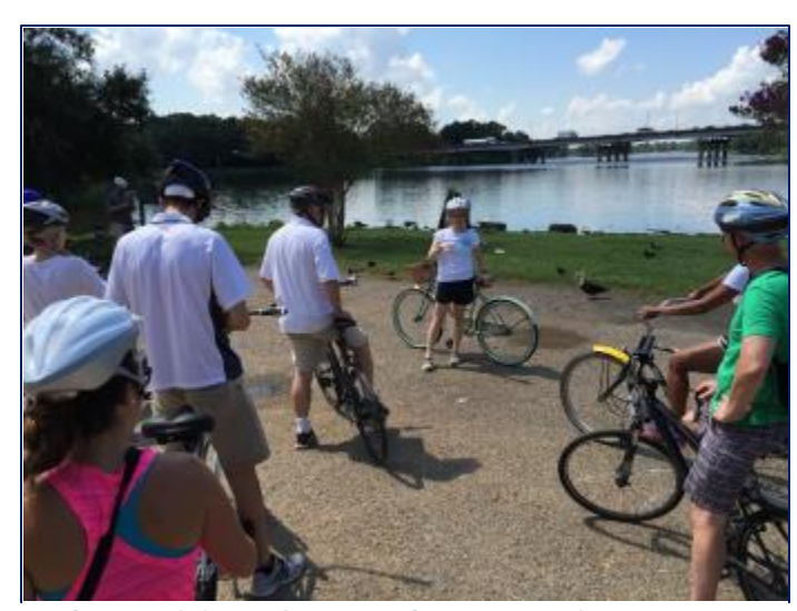
UPGRADES SURROUNDING THE LAKES AREA ARE AN EMERGING OPPORTUNITY TO LINK A BIKESHARE SYSTEM INTO INFRASTRUCTURE IMPROVEMENTS

• Bikeshare as an attraction: Just like public plazas, festivals, convention space and streetscape enhancements, bikeshare is starting to be viewed by downtown promoters across the country as another tool in the toolbox to attract businesses and residences. It appears that bikeshare would complement these and other efforts already underway in Baton Rouge to initiate, incubate, and support partnerships that develop and enhance downtown.