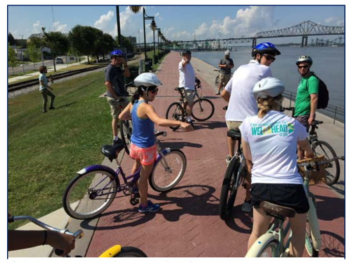
COMMUNITY TOUR ALONG THE LEVEE TRAIL

The two-hour bike tour began at the DDD offices with bicycles on loan from Front Yard Bikeshop, a community bike shop that focuses on teaching