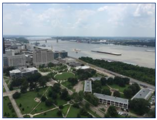
DOWNTOWN BATON ROUGE & THE MISSISSIPPI RIVER FROM ATOP THE LOUISIANA STATE CAPITOL

Today, Baton Rouge residents rely almost exclusively on cars to get from one place to another, due in large part to a lack of other options. Baton Rouge residents generally use vehicles to travel even very short distances. Consequently, traffic problems in the greater Baton Rouge area ranked third worst in the country based on measures of metropolitan area congestion from Texas A&M Transportation Institute's 2015 Urban Mobility Scorecard <sup>1</sup>. Baton Rouge was also recently ranked the most obese metro area in the country – a correlation worth noting with regard to traffic congestion—according to Gallup-Healthways 2014