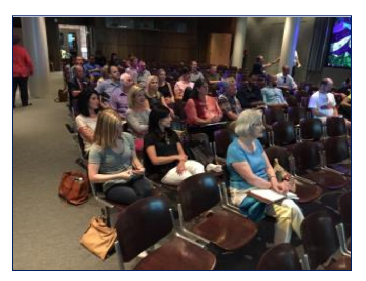
APPROXIMATELY 50 PEOPLE ATTENDED THE BIKESHARE COMMUNITY WORKSHOP AT THE LOUSIANA ART & SCIENCE MUSEUM

A short presentation by the project team provided attendees with an overview of bikeshare, its benefits, and case studies from other communities. EPA staff provided an overview of the Building Blocks for Sustainable Communities program. The project team led the presentation and facilitated community discussion on priorities for bikeshare and bicycling in general throughout the city. Three media organizations attended the event. They aired news segments on local NBC and FOX stations and published an article in LSU's The Daily Reveille newspaper.